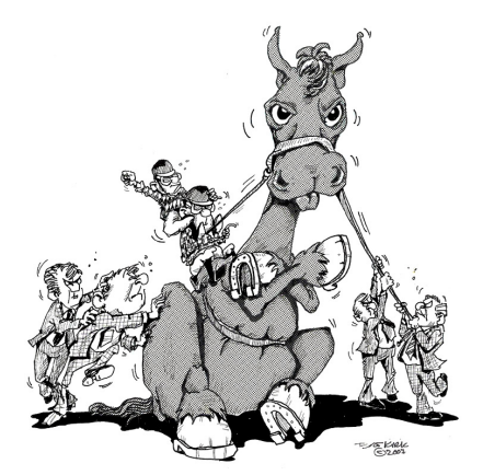
Applications have an attitude